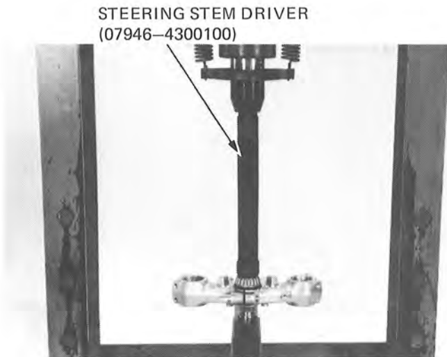
STEERING STEM DRIVER (07946-4300100)

Install the dust seal. Install the lower taper roller bearing using a hydraulic press and Steering Stem Driver. Install the steering stem bolt and tighten it.