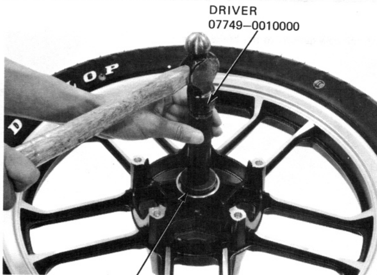
ATTACHMENT, 42 x 47 mm 07746-0010300 PILOT, 15 mm 07746-0040300

Drive in the left bearing squarely making sure that it is fully seated and that the sealed side is facing out.