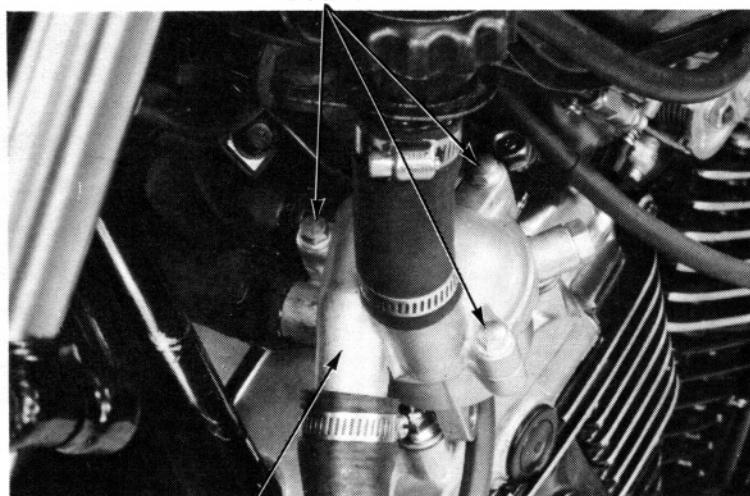
THERMOSTAT HOUSING COVER