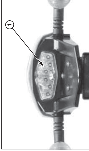
(1) BRAKE LIGHT LAMP

Checking indicator line: Connect the terminals of the connector 2P (white) of the indicator relay with a jumper wire.