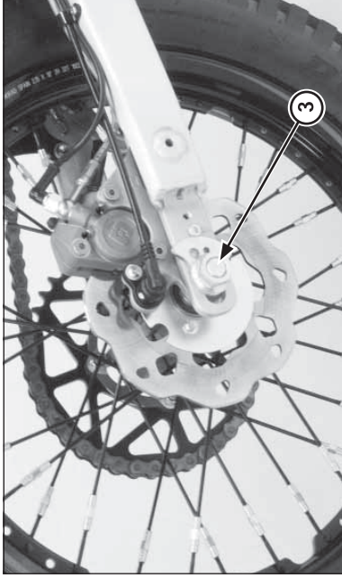
(3) AXLE NUT

Insert the rear axle into the left chain adjuster, side collar and wheel.