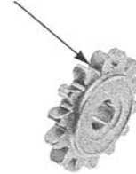
STARTER IDLE GEAR

Check the starter idle gear and shaft for wear or damage, replace them if necessary.