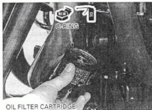
OIL FILTER CARTRIDGE

Install the new oil filter and tighten it to the specified torque.