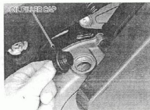
OIL FILLER CAP

Start the engine and let it idle for 2 to 3 minutes. Stop the engine and recheck the oil level. Make sure there are no oil leaks.