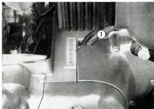
Fig. 1-2 ① Engine serial number

The frame serial number is stamped on the left side of the steering head pipe and engine serial number is located on the top of the crankcase left side. Whenever ordering replacement parts or making inquiries concerning the particular motorcycle, always included the frame or the engine number whichever is applicable. (Fig. 1-1, 2)