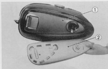
Fig. 4.43 Removing tank side cover ① Fuel tank ② Tank side cover