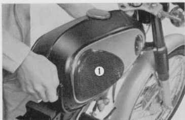
Fig. 4.42 Removing fuel tank ① Fuel tank