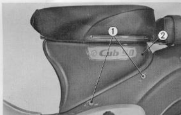
Fig. 4.45 Removing fuel tank ① Fuel tank mounting bolt ② Fuel tank

3. Withdraw the fuel tank ① from the rear, raising it slightly. (Fig. 4.42)