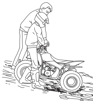
Body position for backing down a hill.