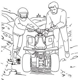
Be sure your legs are clear of the wheels.

If the hill is not too steep and you have good footing, you may be able to walk the ATV back down the hill. Make sure your intended path is clear in case you lose control of the ATV.