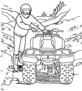
Be sure your legs are clear of the wheels.

If the hill is not too steep and you have good footing, you may be able to walk the ATV back down the hill. Make sure your intended path is clear in case you lose control of the ATV.