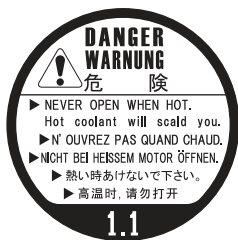
1.1 radiator cap danger