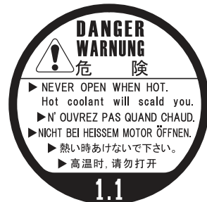
1.1 radiator cap danger