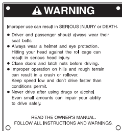
general warning & general information