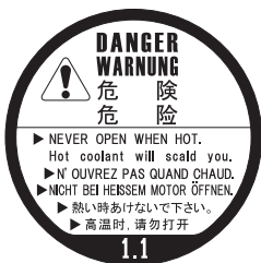
radiator cap danger