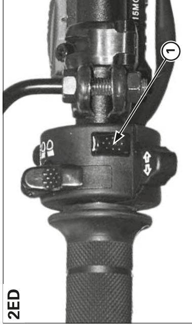
(1) HORN BUTTON