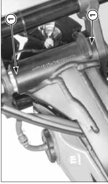
(1) STEERING HEAD BEARINGS