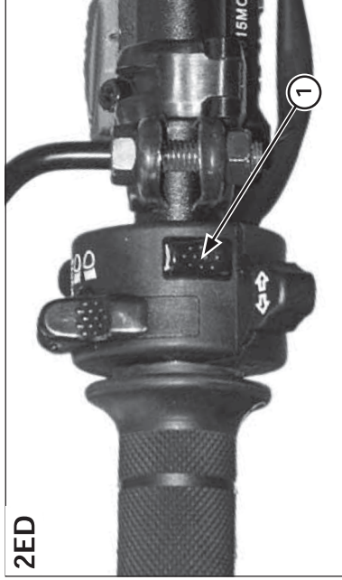
(1) HORN BUTTON