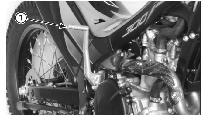
(1) KICKSTARTER PEDAL

When filling the coolant system, be sure to bleed air completely. If not, the system cannot be sufficiently filled and will cause overheating.