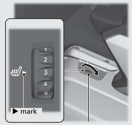
Passenger seat heater switch

The passenger seat heater indicator goes off