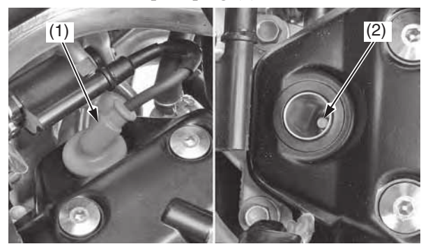
(1) spark plug cap