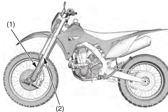
(1) fork protectors