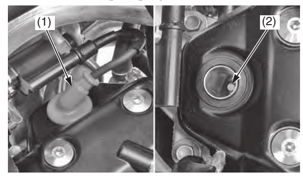
(1) spark plug cap