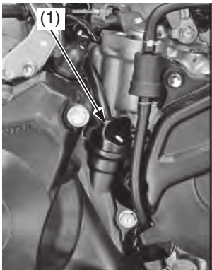
(1) engine oil fill cap/dipstick (2) upper level mark (3) lower level mark