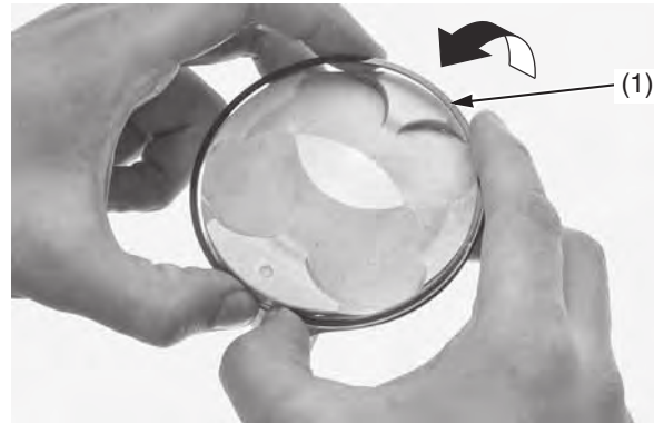
(1) piston ring

Do not damage the piston ring by spreading the ends too far.