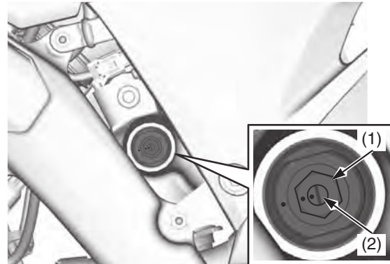
(1) high speed compression damping adjuster (2) low speed compression damping adjuster