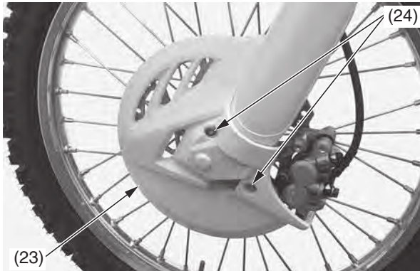
(23) disc cover (24) disc cover socket bolts