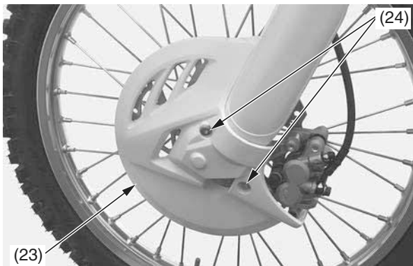
(23) disc cover (24) disc cover socket bolts