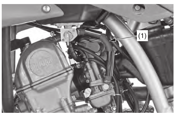
(1) fuel line