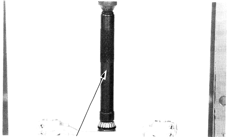
STEERING STEM DRIVER AND ATTACHMENT 07946-MB00000 or 07953-4300100 ATTACHMENT GN-HT-54 (U.S.A. only)

Install the dust seal onto the steering stem and press a new lower bearing over the stem with a special tool.