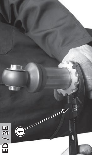
(1) SPANNER WRENCH