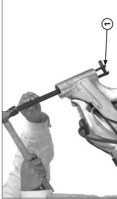
(1) BALL RACE REMOVER

Remove the lower bearing and dust seal from the steering stem.