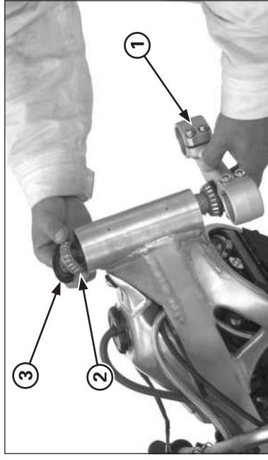
(1) STEM (2) UPPER BEARING (3) DUST SEAL