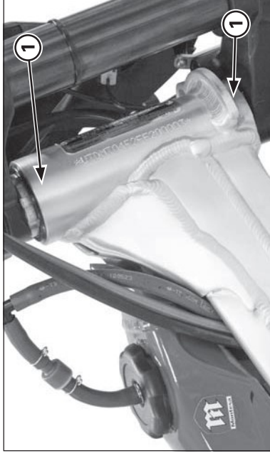
(1) STEERING HEAD BEARINGS