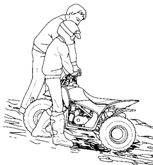
Body position for backing down a hill.