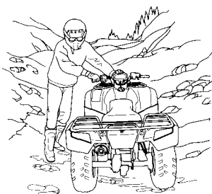
Be sure your legs are clear of the wheels.

If the hill is not too steep and you have good footing, you may be able to walk the ATV back down the hill. Make sure your intended path is clear in case you lose control of the ATV.