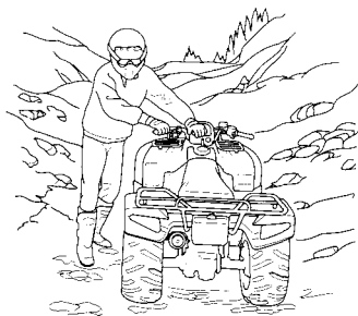
Be sure your legs are clear of the wheels.

If the hill is not too steep and you have good footing, you may be able to walk the ATV back down the hill. Make sure your intended path is clear in case you lose control of the ATV.