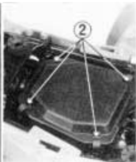
(2) Retainer clips