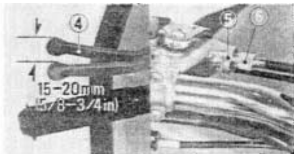
(4) Rear brake lever

Check the brake cable for kinks or signs of wear that could cause sticking or failure. Lubricate the brake cable with a commercially available cable lubricant to