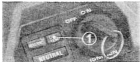
(1) Engine oil temperature warning lamp

A heavy duty cooling fan is available as an optional part to provide more air flow through the radiator under adverse condition.