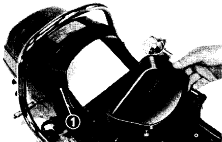
(1) Document compartment

This owner's manual and other documents should be stored in the plastic bag in the compartment. When washing your motorcycle, be careful not to flood this area with water.