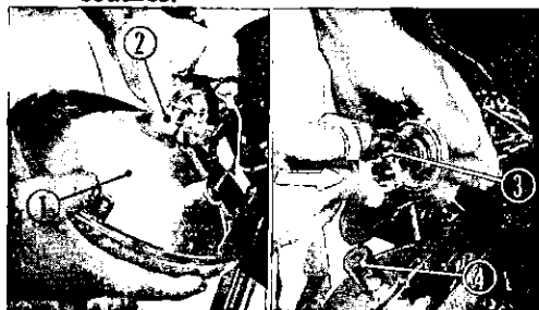
① Headlight ② Headlight socket