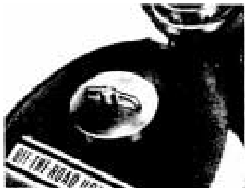
SEALING FUEL TANK CAP- OPTIONAL EQUIPMENT.