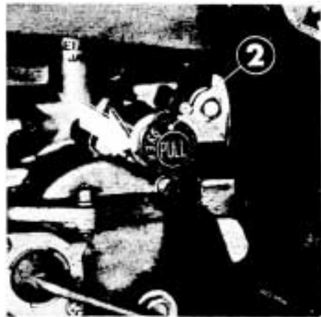
② High altitude compensator knob