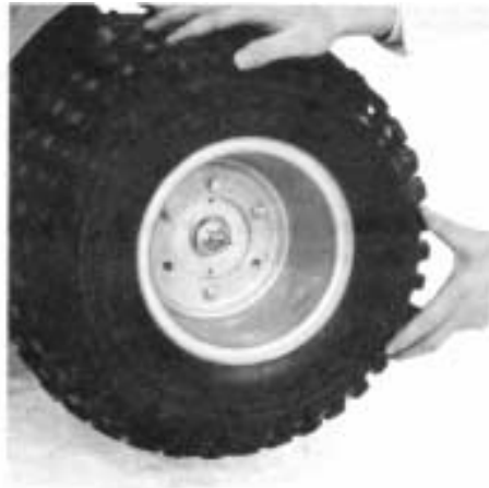
① Wheel nuts