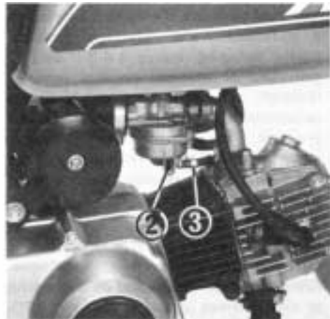
② Drain screw ③ Drain tube