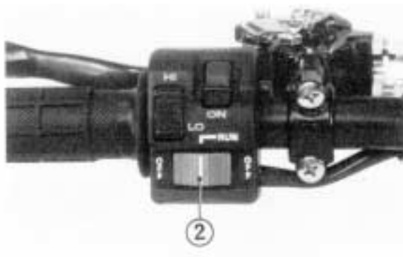
(2) Ignition switch