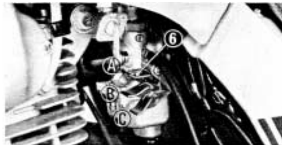
(6) Choke lever (B) Half position (A) Fully Closed (C) Fully Open