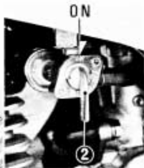
(2) Fuel valve