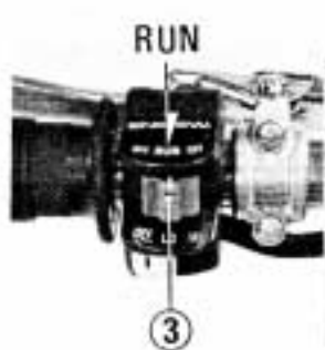
(3) Ignition switch