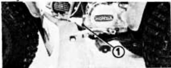
(1) Carburetor drain tube