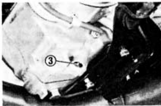
(3) Tensioner bolt